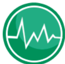
Health and wellbeing