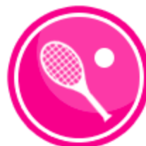
Things to do