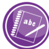
Education and learning